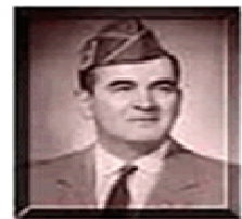
Dr. Hector P. Garcia

The BOT meets the 2nd Tuesday of each month. The meeting are open to the Membership.