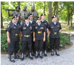
AGIF-Mile Hi Chapter Color/Honor Guard at the Vietnam Memorial